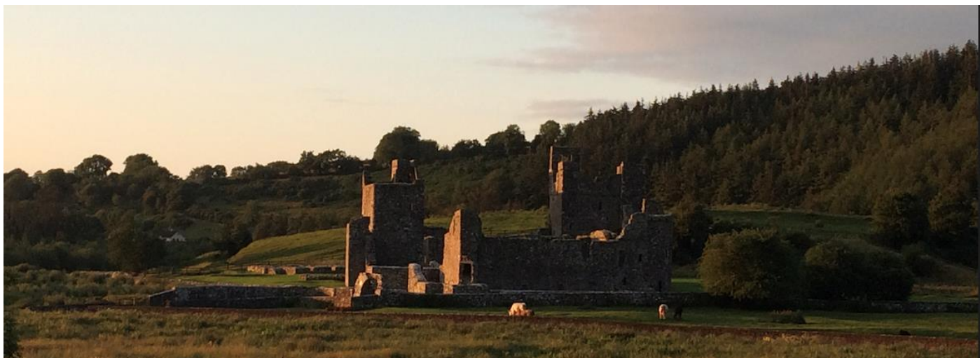
Fore Abbey, Co. Westmeath on a July evening