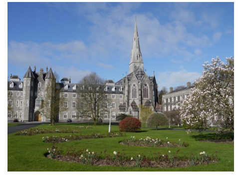
St Patrick's College

SNSBI 25th Annual Conference, St Patrick's College, Maynooth.