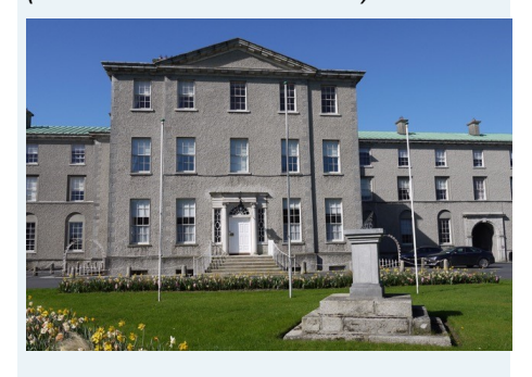
St Patrick's College